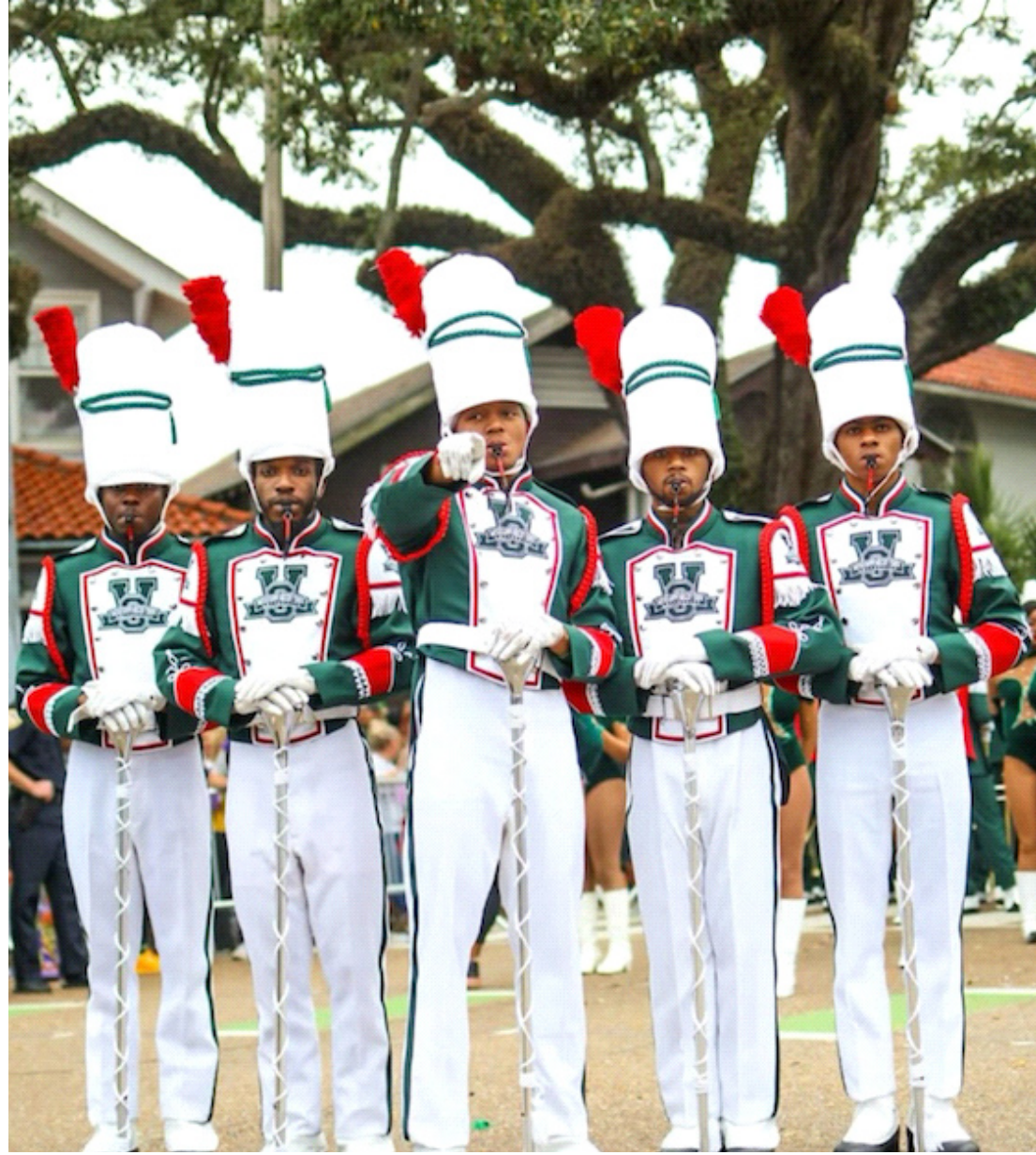
Members of the famed Mississippi Valley State University (MVSU) Mean Green Marching Machine show off uniforms.

ITTA BENA, MS— The celebrated "Mean Green Marching Machine" marching band from Mississippi Valley State University (MVSU) has received an invitation to participate in the 60th Presidential Inauguration Parade